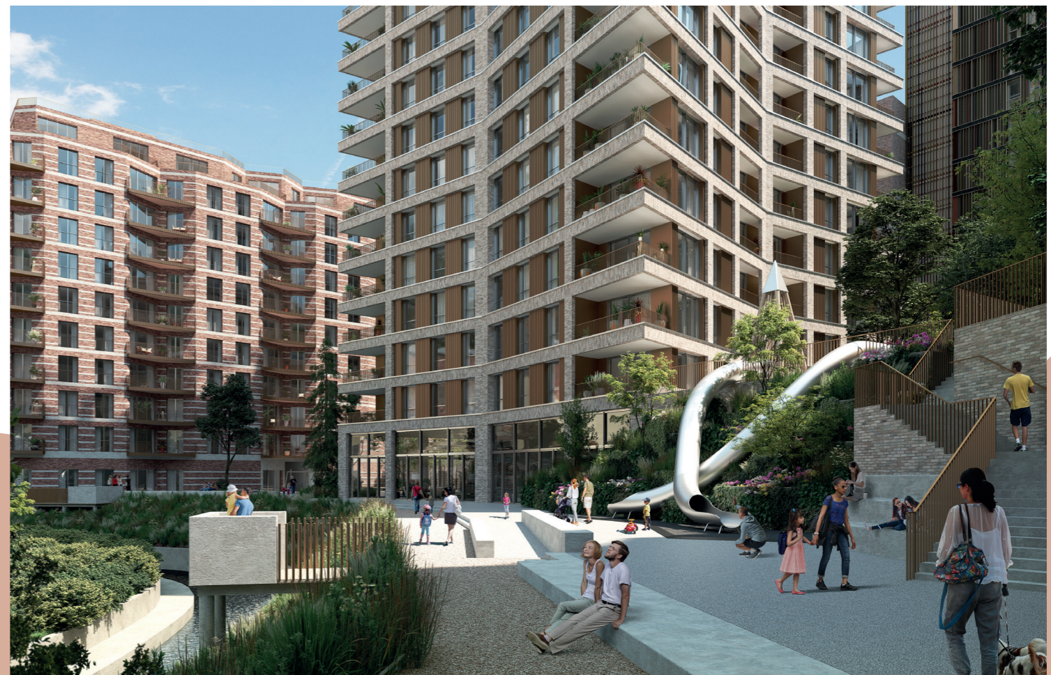
Euro House, Wembley Park, HA9 0TF.