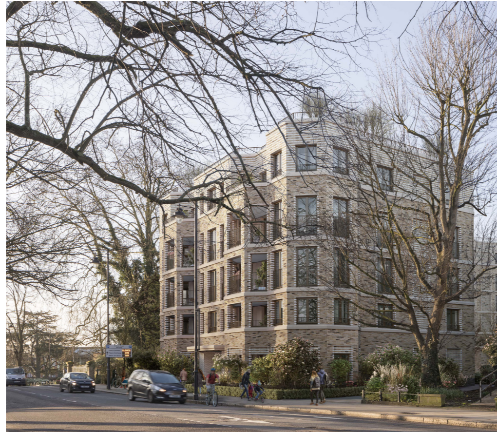
100 Church Street, Enfield, EN2 6BQ.

To supply our growing Build to Rent (BTR) pipeline across the UK, we're seeking locations for residential development, preferring unconditional sites in commuter belt towns, or in the suburbs of major UK cities, close to transport nodes.